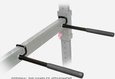
OPTIONAL DIP HANDLES ATTACHMENT