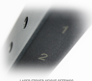
LASER ETCHED HEIGHT SETTINGS