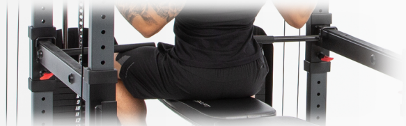
USE OPTIONAL DIP HANDLES AS KNEE HOLD DOWN