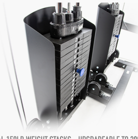
DUAL 150LB WEIGHT STACKS - UPGRADEABLE TO 200LBS