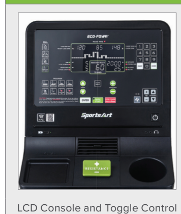
LCD Console and Toggle Control