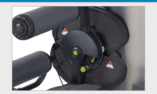
Dual cam system improves biomechanics and reduces cable slack