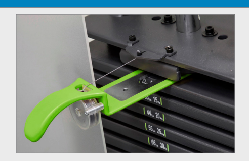
Stacks feature sound dampeners and magnetized selector fork for maximum stability